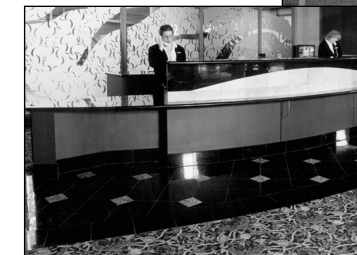
Business - Best Western-Victoria Inn