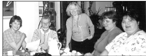
Management Committee at work

We keep informed about how the latest technology, products and services can improve accessibility through regular communication with individuals and community organizations. We also liaise with other Canadian cities to learn what they are doing to enhance accessibility.