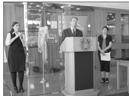
2003 Accessibility Awards

The past year has been an exciting time of progress towards universally accessible civic government, services and facilities. Here are the AAC's Top Ten Activities for 2003: