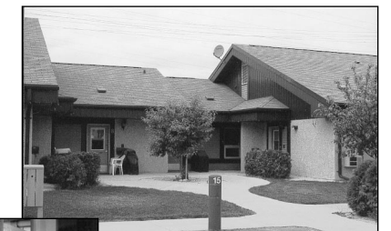
Residential - Tranquility Place