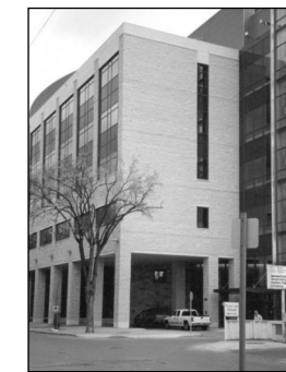
Government - CancerCare Manitoba